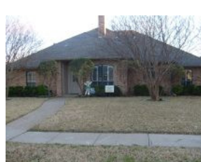
1808 Campbell Trail